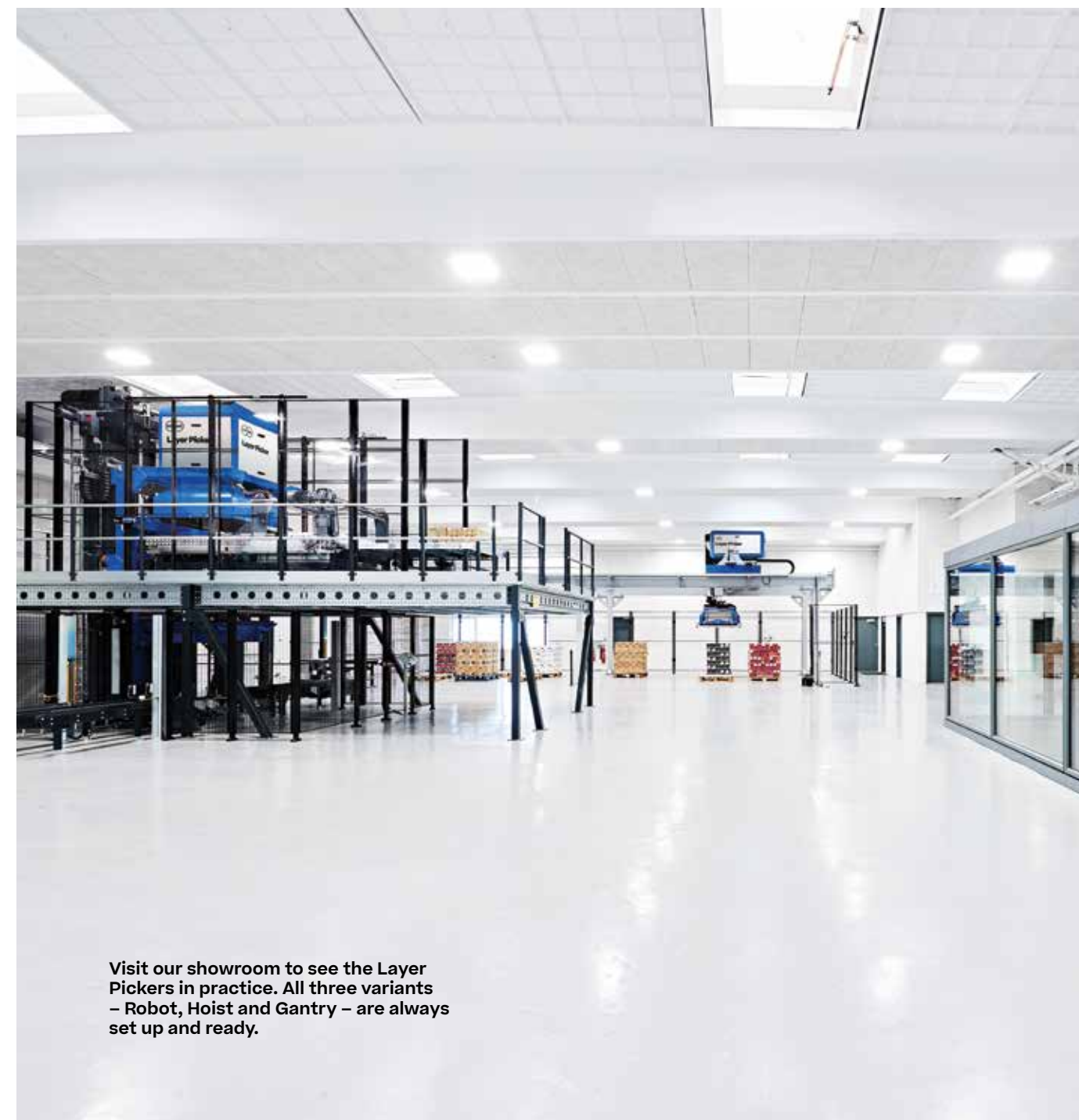
Visit our showroom to see the Layer Pickers in practice. All three variants – Robot, Hoist and Gantry – are always set up and ready.