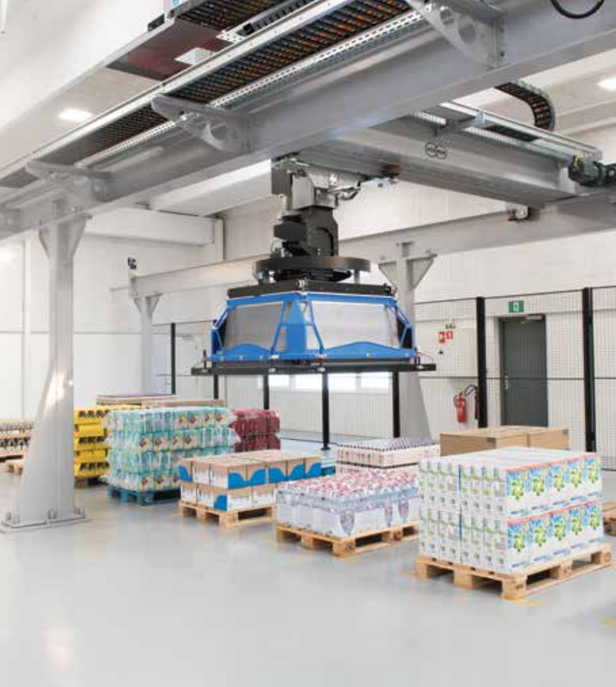
Körber's Layer Picker is the industry standard and leading technology for both de-palletizing and pallet-to-pallet picking.