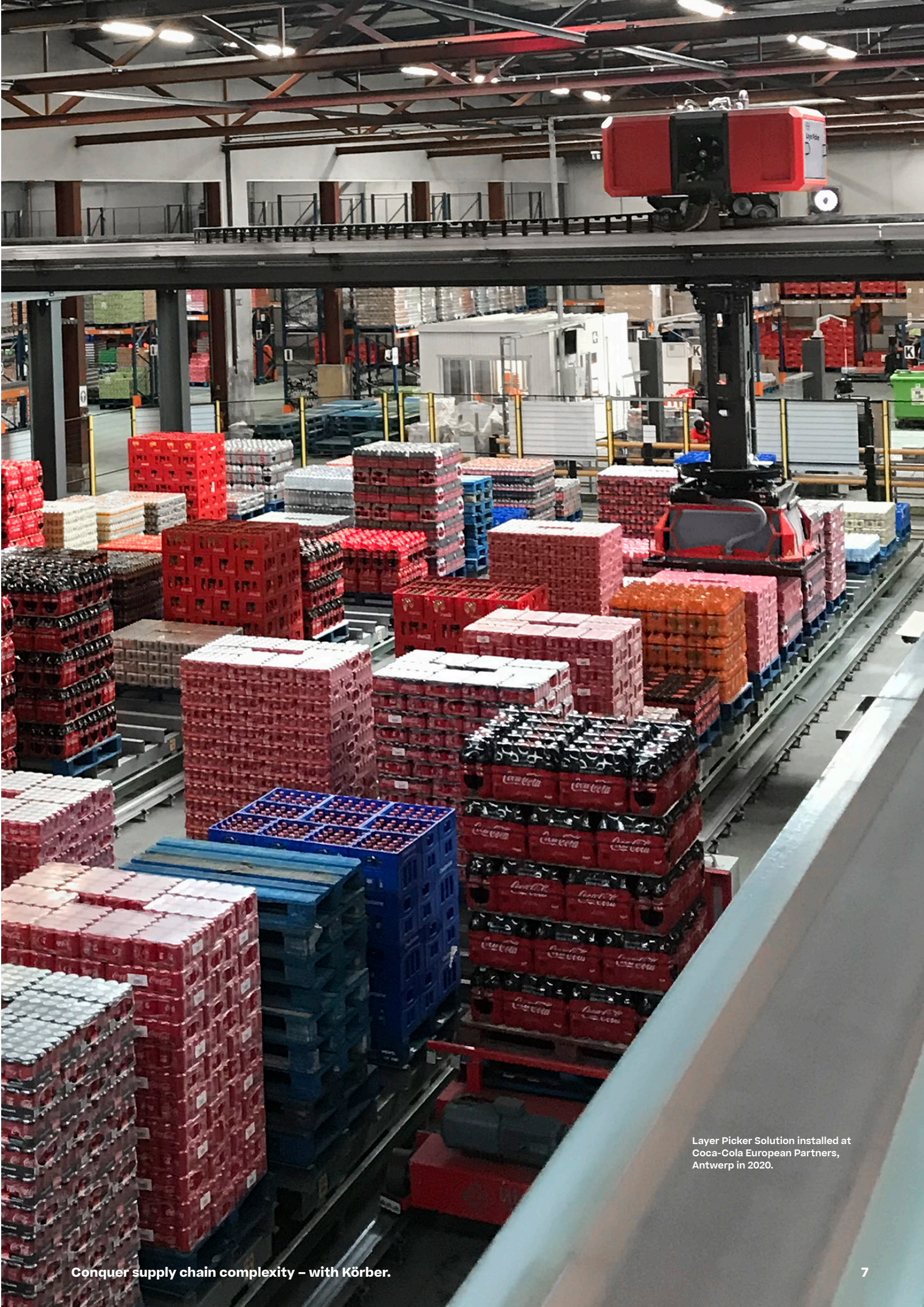
Layer Picker Solution installed at Coca-Cola European Partners, Antwerp in 2020.